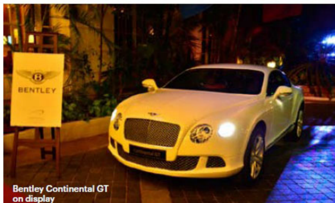
Bentley Continental GT on display