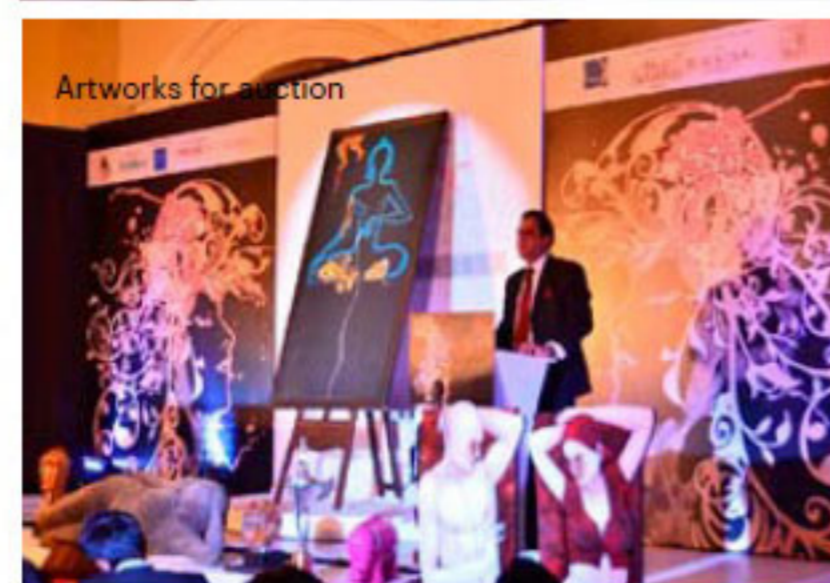
Artworks for auction