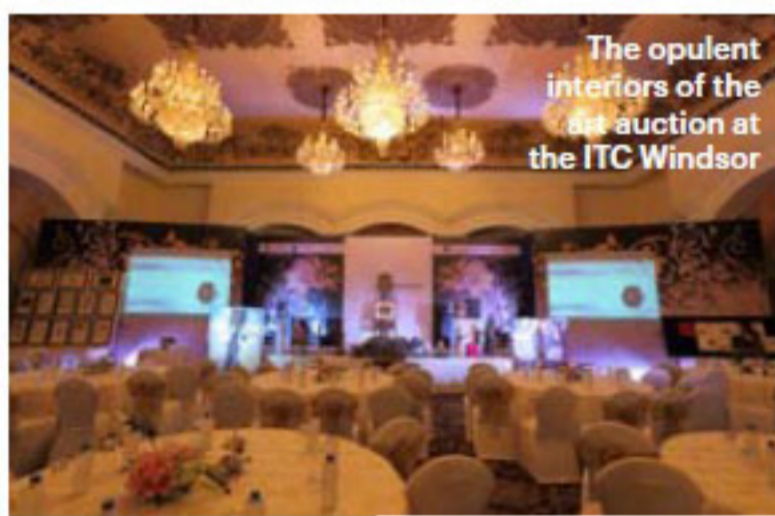
The opulent interiors of the art auction at the ITC Windsor