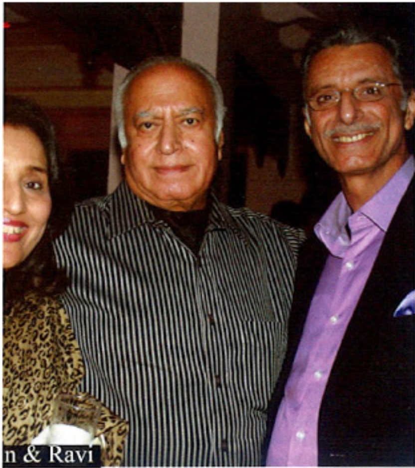
n & Ravi